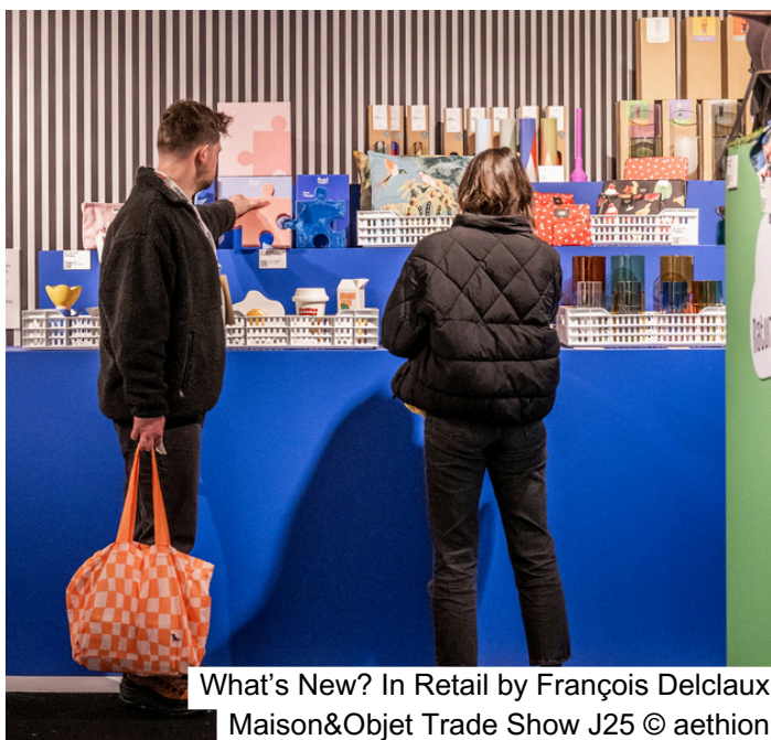
What's New? In Retail by François Delclaux Maison&Objet Trade Show J25