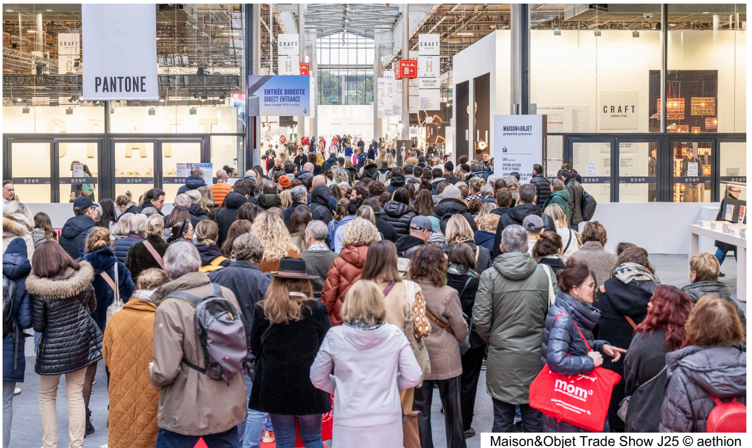
Maison&Objet Trade Show J25

The January 2025 event marked a key milestone in the transition that began last September. Originality, boldness, desirability and innovation: these four words sum up this year's event, a unique experience at the crossroads of business and creation.