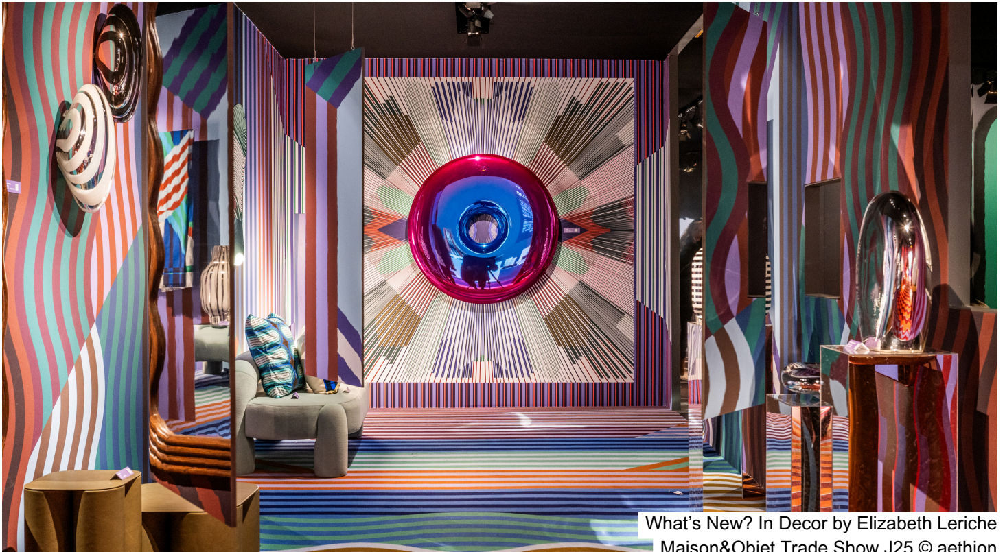
What's New? In Decor by Elizabeth Leriche Maison&Objet Trade Show J25

To celebrate the 100th anniversary of surrealism , the talented Elizabeth Leriche immersed visitors in decor created with some of the show's finest gems , crafting a series of disruptive, poetic scenes : an enchanted forest, a bed in the clouds, hypnotic motifs, an upside-down room. It was easy to spot the trends for the coming season from among the show's exhibitors.