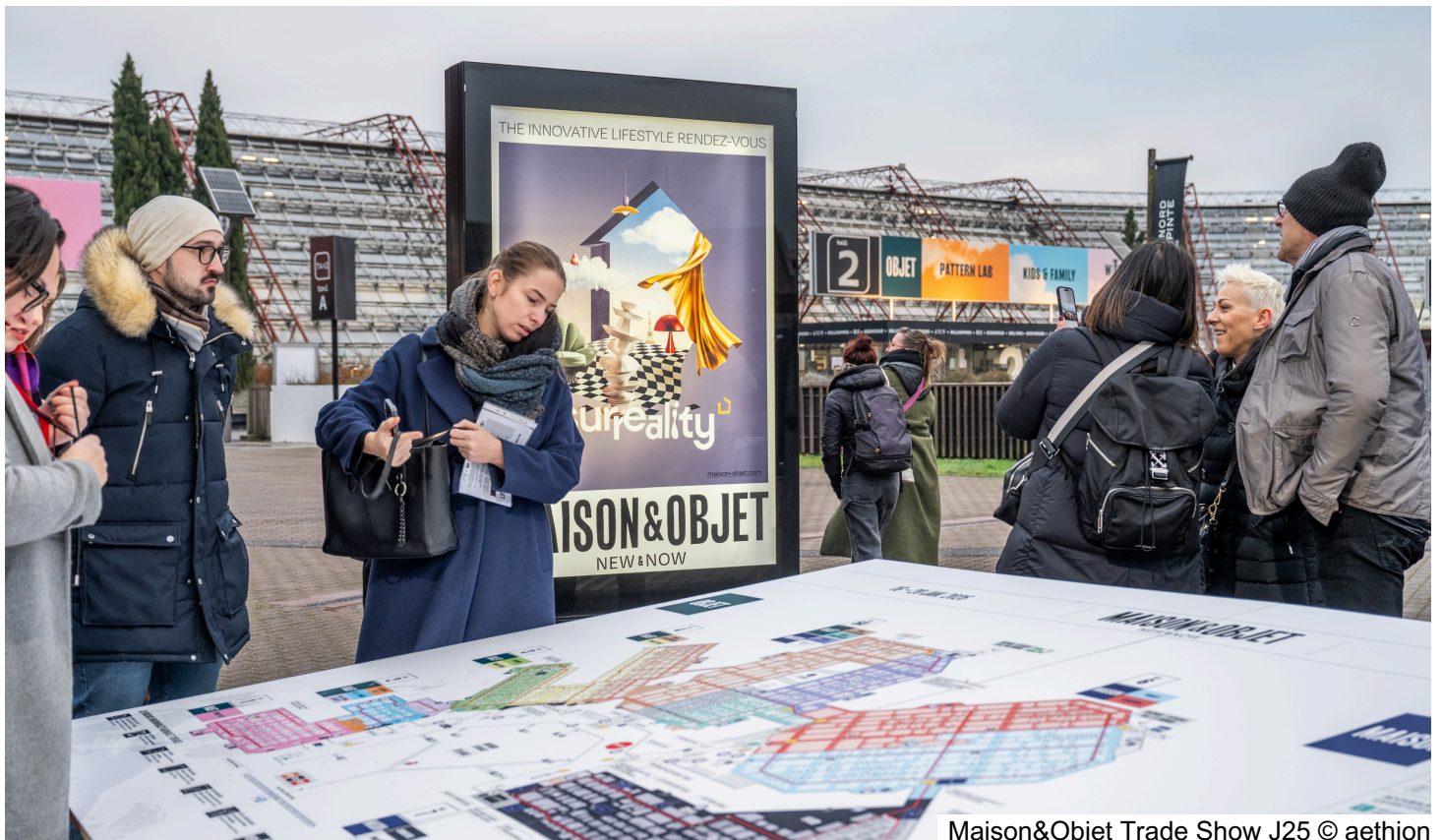
Maison&Objet Trade Show J25