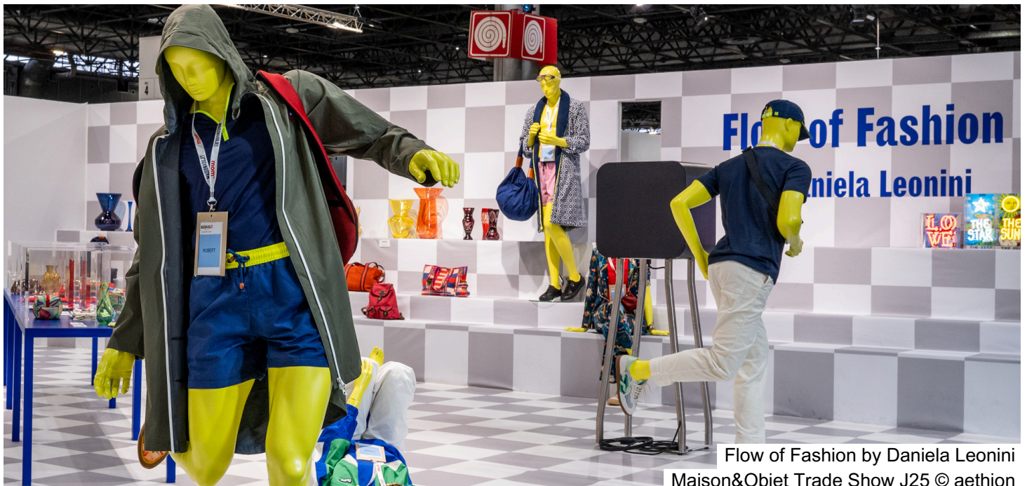
Flow of Fashion by Daniela Leonini Maison&Objet Trade Show J25

Symbolising the revival of the fashion sector, this innovative space reinvented fashion in harmony with decor. A true next-generation concept store, Flow of Fashion redefined physical retailing by blurring the boundaries between these two worlds. More than just a store, it offered a hybrid experience where physical mannequins were doubled on screen and came to life with AI, in collaboration with Artcare, an agency specialising in digital mannequins. Here, gift ideas, fashion accessories and home decor all came together in an immersive, unique shopping experience.