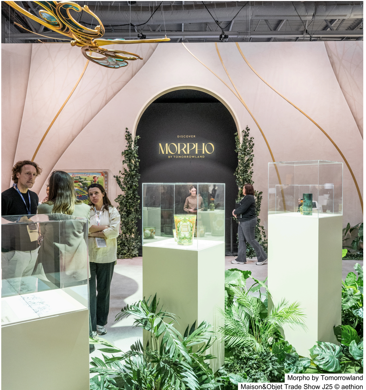
Morpho by Tomorrowland Maison&Objet Trade Show J25

The preview's eagerly awaited foray into the world of decor and design was a wonderful surprise. Maison&Objet will be supporting and accelerating MORPHO's development in 2026 , so stay tuned!