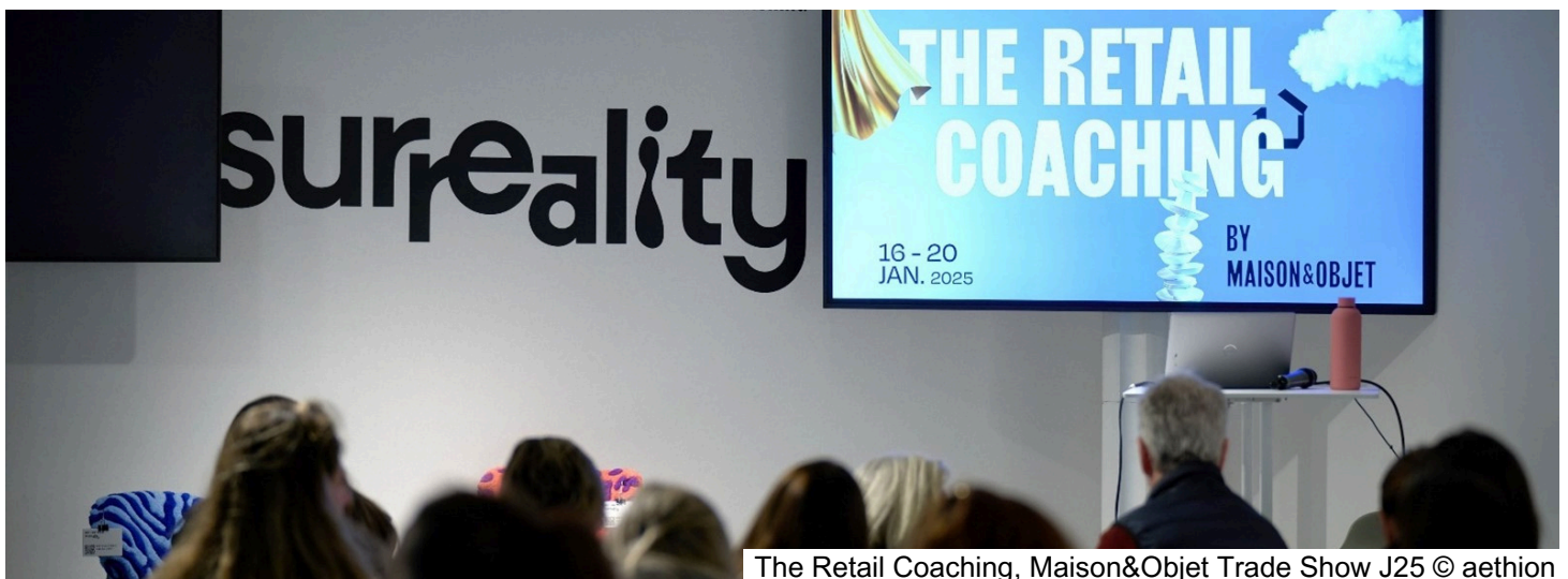
The Retail Coaching, Maison&Objet Trade Show J25

This series of practical workshops for retail professionals aimed to rethink sales and merchandising strategies in an ever-changing industry. The workshops addressed issues such as sound identity in shops, the use of AI in point-of-sale communications and the latest in e-commerce tools.