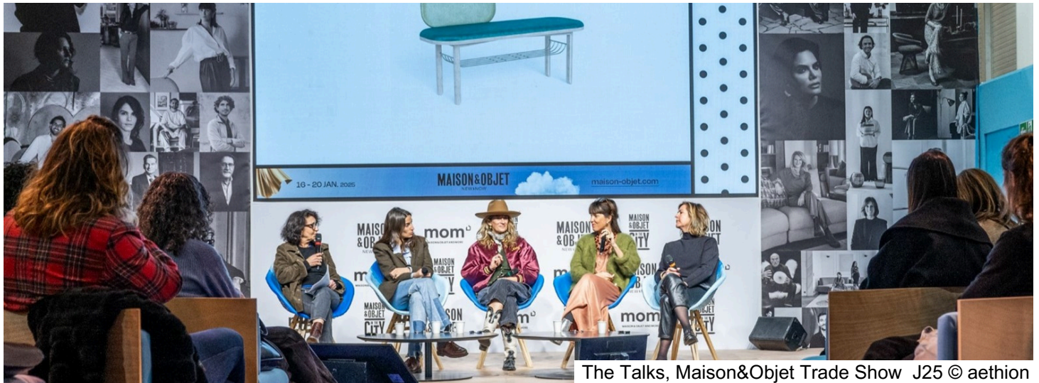
The Talks, Maison&Objet Trade Show J25