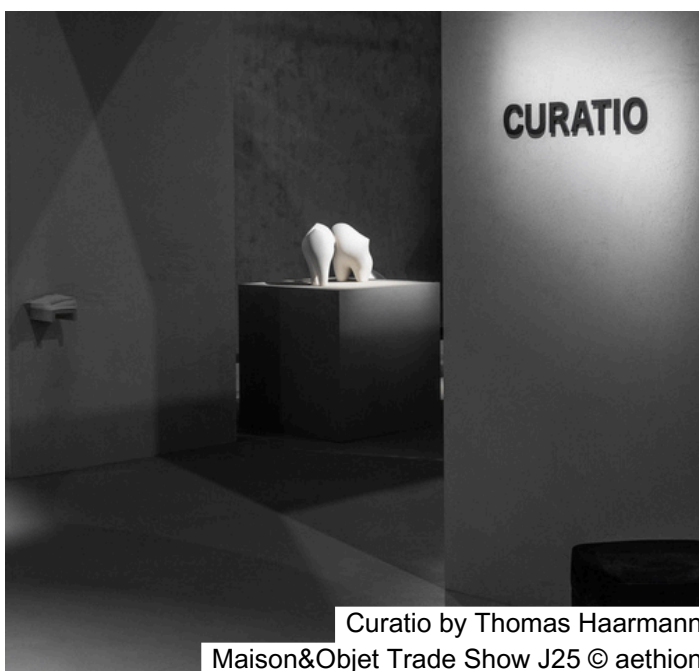
Curatio by Thomas Haarmann Maison&Objet Trade Show J25