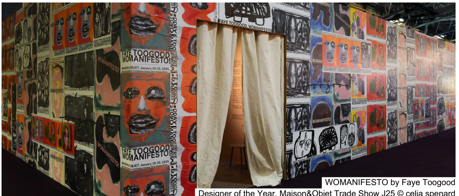
WOMANIFESTO by Faye Toogood

Through three worlds of colour , we explore her practice through both the object and her process. From shadow to light, she unveils the deepest facets of her personality, revealing her true self. Her mind is an ever-changing landscape, always in motion, where creativity knows no bounds, slipping seamlessly from carpets to settees, from paper sculptures to fashion.