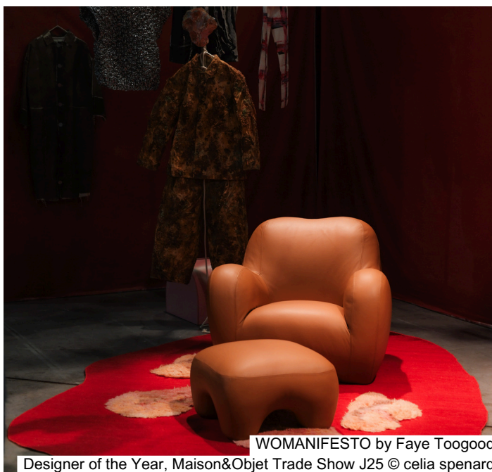
WOMANIFESTO by Faye Toogood