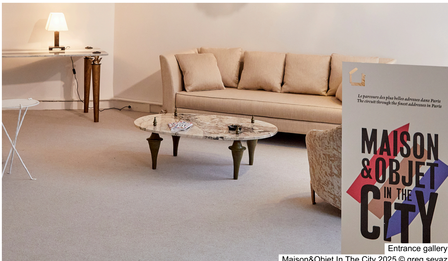
Maison&Objet In The City 2025