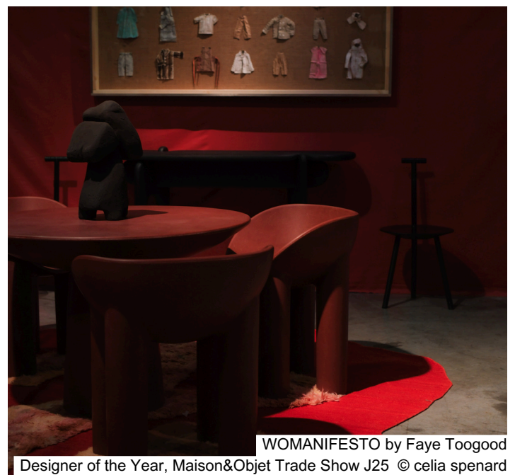
WOMANIFESTO by Faye Toogood