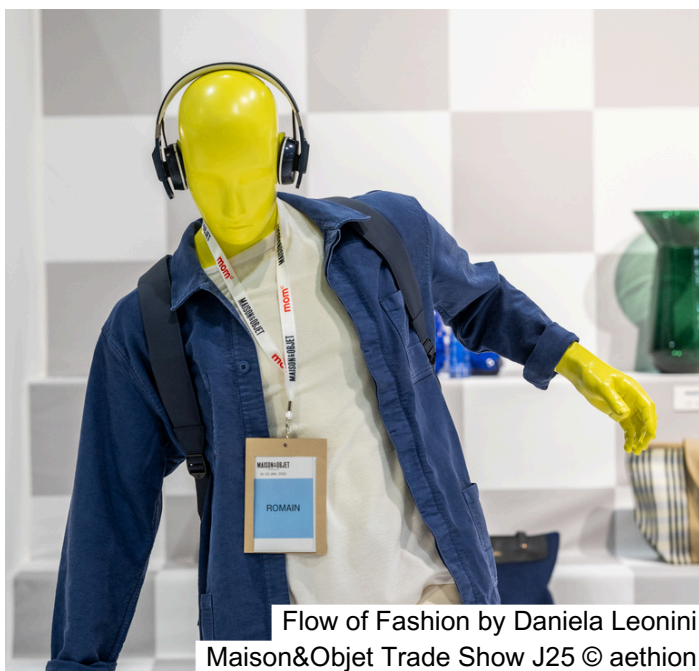
Flow of Fashion by Daniela Leonini Maison&Objet Trade Show J25