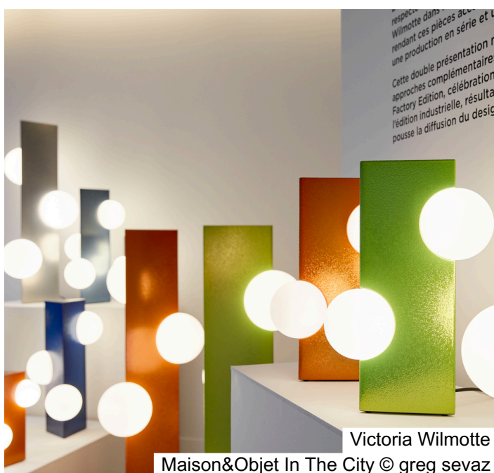
Victoria Wilmette Maison&Objet In The City