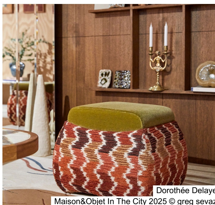
Dorothee Delaye Maison&Objet In The City 2025