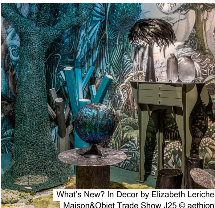
What's New? In Decor by Elizabeth Leriche Maison&Objet Trade Show J25