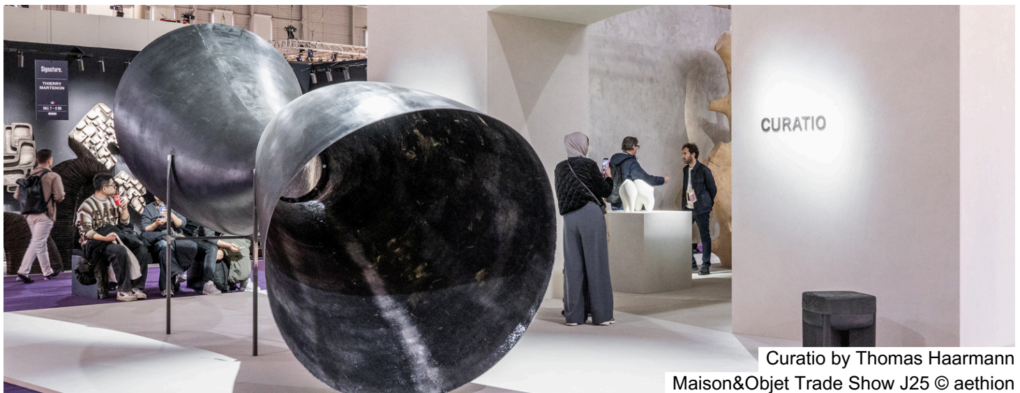
Curatio by Thomas Haarmann Maison&Objet Trade Show J25

At the crossroads of sculpture and furniture, these pieces are destined to find their place in collectors' homes, signalling the singularity of prestigious hotels and restaurants. This exhibition was the next step in the show's move upmarket, firmly asserting the demanding nature of the collection's design and setting the stage for future innovation at the January 2026 event.