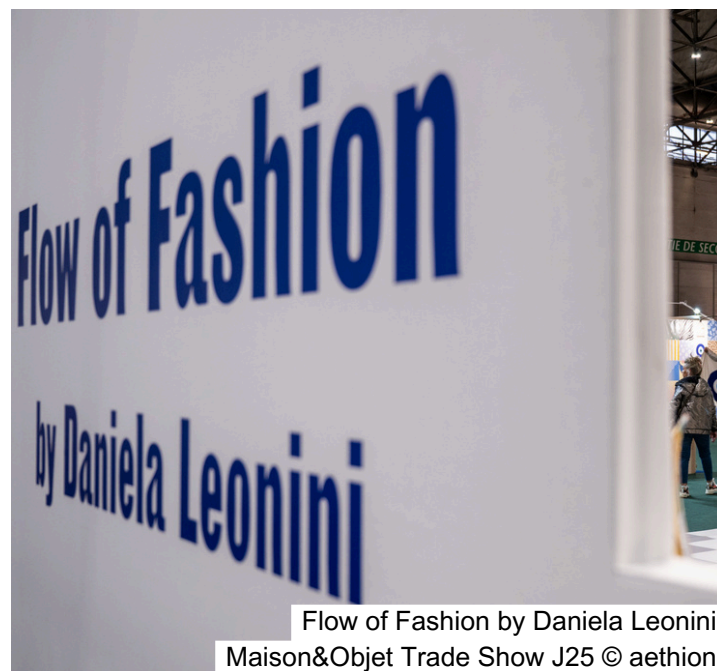
Flow of Fashion by Daniela Leonini Maison&Objet Trade Show J25