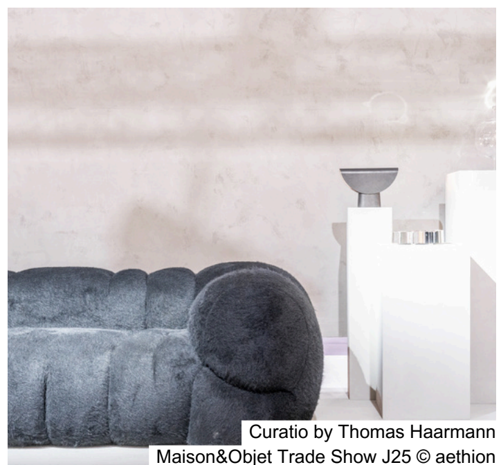
Curatio by Thomas Haarmann Maison&Objet Trade Show J25