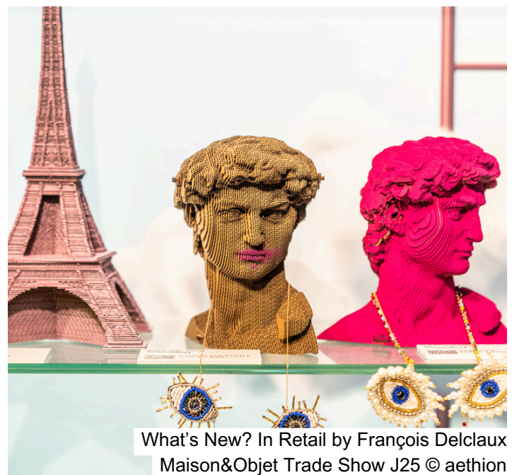
What's New? In Retail by François Delclaux Maison&Objet Trade Show J25