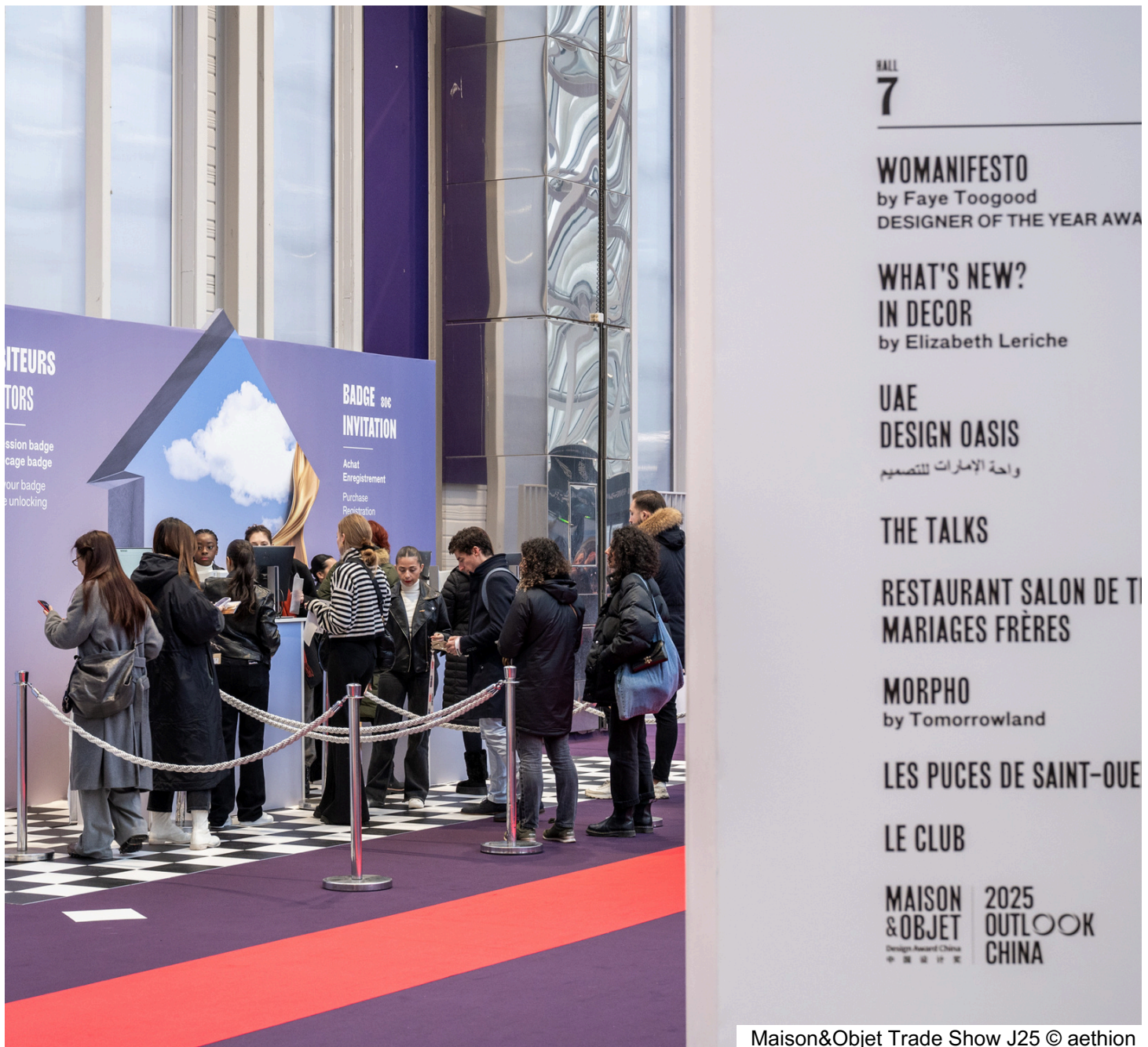
Maison&Objet Trade Show J25

In addition to a carefully selected offering in 15 sectors , Maison&Objet has also made investments designed to attract new visitors, through practical yet inspiring programmes: What's New? This signature programme showcases highly desirable projects, ideas and concepts that can be effortlessly adapted as well as emerging trends that are redefining each of the three featured sectors.