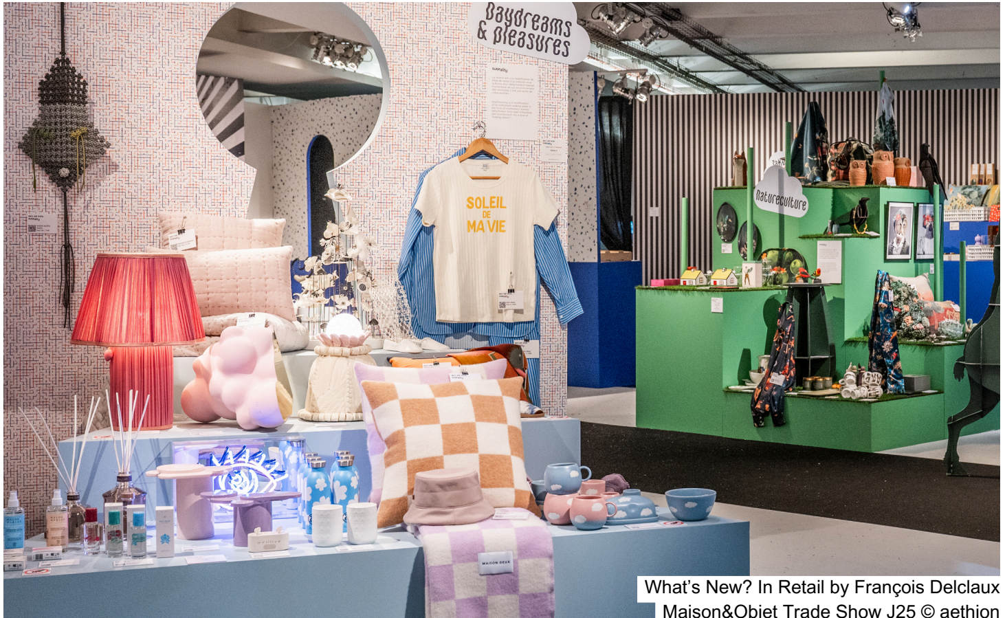
What's New? In Retail by François Delclaux Maison&Objet Trade Show J25

François Delclaux dreamed up a cabinet of curiosities for retailers , staged so as to foreshadow the ideal concept, at the crossroads of a unique retail experience original boutique entertainment and trendy items that will set the tone for the season