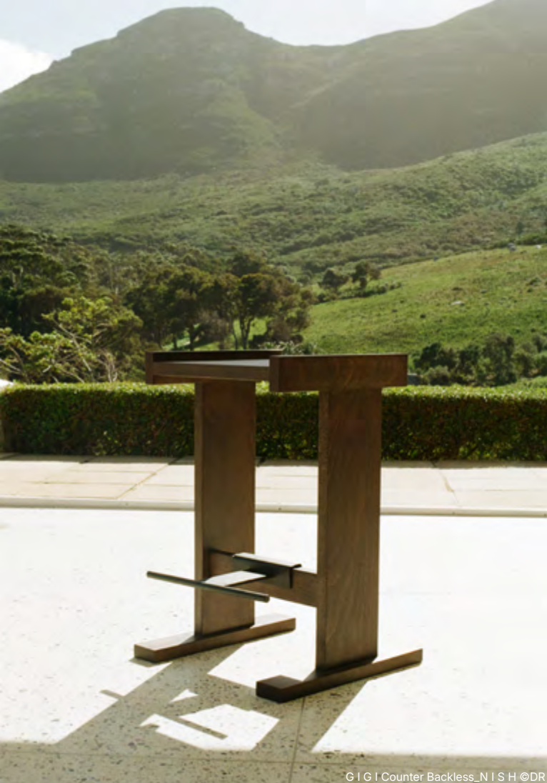
G I G I Counter Backless_N I S H

in south africa, a stylistic revolution rooted in both local heritage and forward-looking perspectives is quietly emerging before asserting itself with confidence.