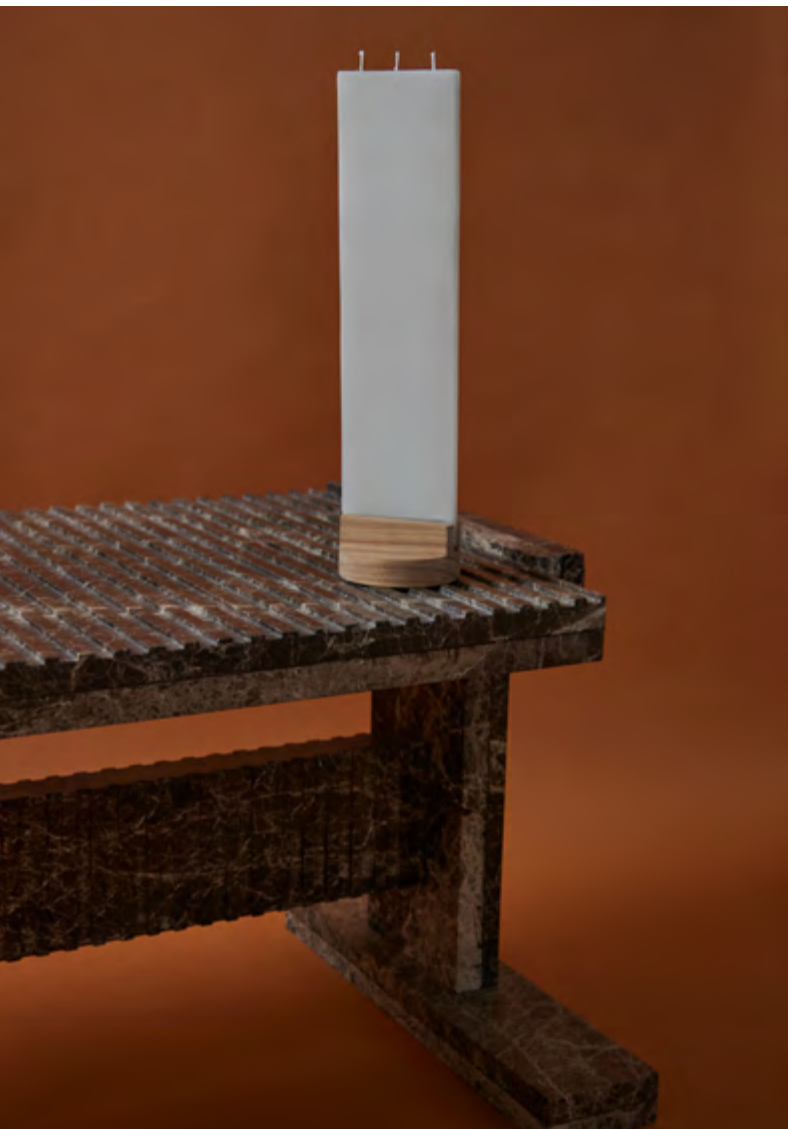
Un tabouret : G I G I Counter Backless_N I S H

"Maison&Objet will be an opportunity to present the founding pieces of N I S H, manifesto works serving as a first introduction."