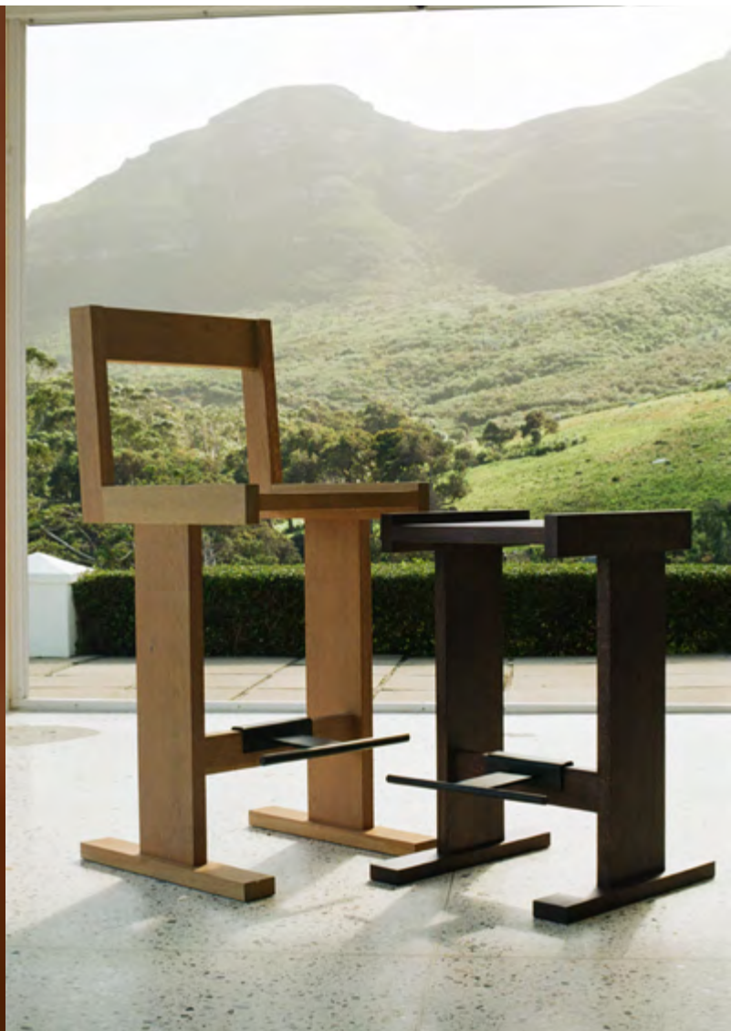
Deux tabourets : G I G I Bar Counter_N I S H