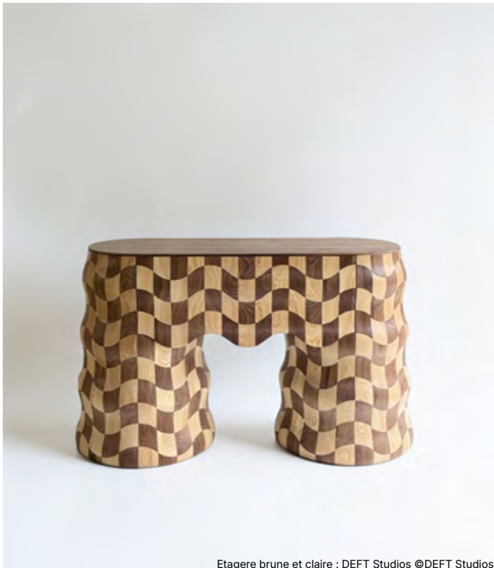
Etagere brune et claire : DEFT Studios

“A memory. Each of our pieces is designed as an heirloom to be passed on to future generations.”