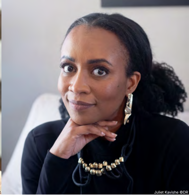
Juliet Kavishe

"Each of the selected designers and studios combines contemporary design and artisanal craftsmanship in a truly distinctive way. Together, they reflect the vibrant energy currently driving the South African design scene."